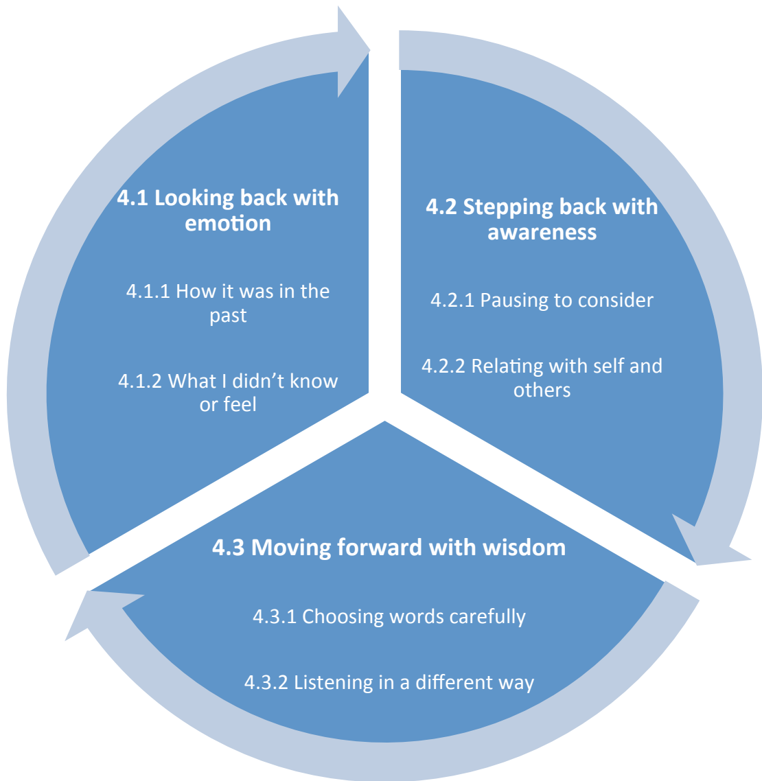
Figure 1: Diagram to Show an Overview of Themes and How They Impact on Each Other.